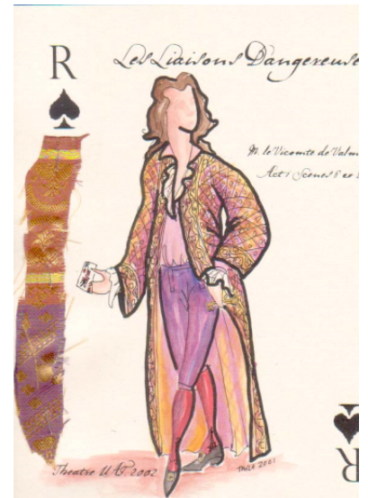
Costume sketch from Dangerous Liaisons