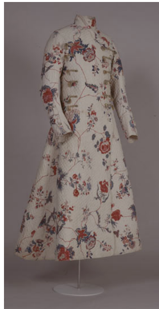
Banyan worn by George IV c1780-1790 when he was Prince of Wales

Look for them in movies: Tom Wilkinson as General Cornwallis in The Patriot ; John Malkovich has several scenes in a banyan in Dangerous Liaison ; John Hurt as the Marques of Montrose in Rob Roy ; and Julian Sands as Louis XIV in Vatel .